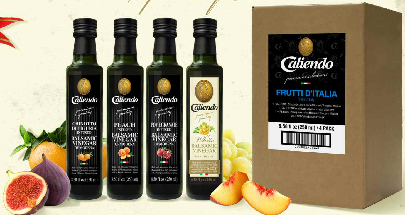
Frutti D'italia shown