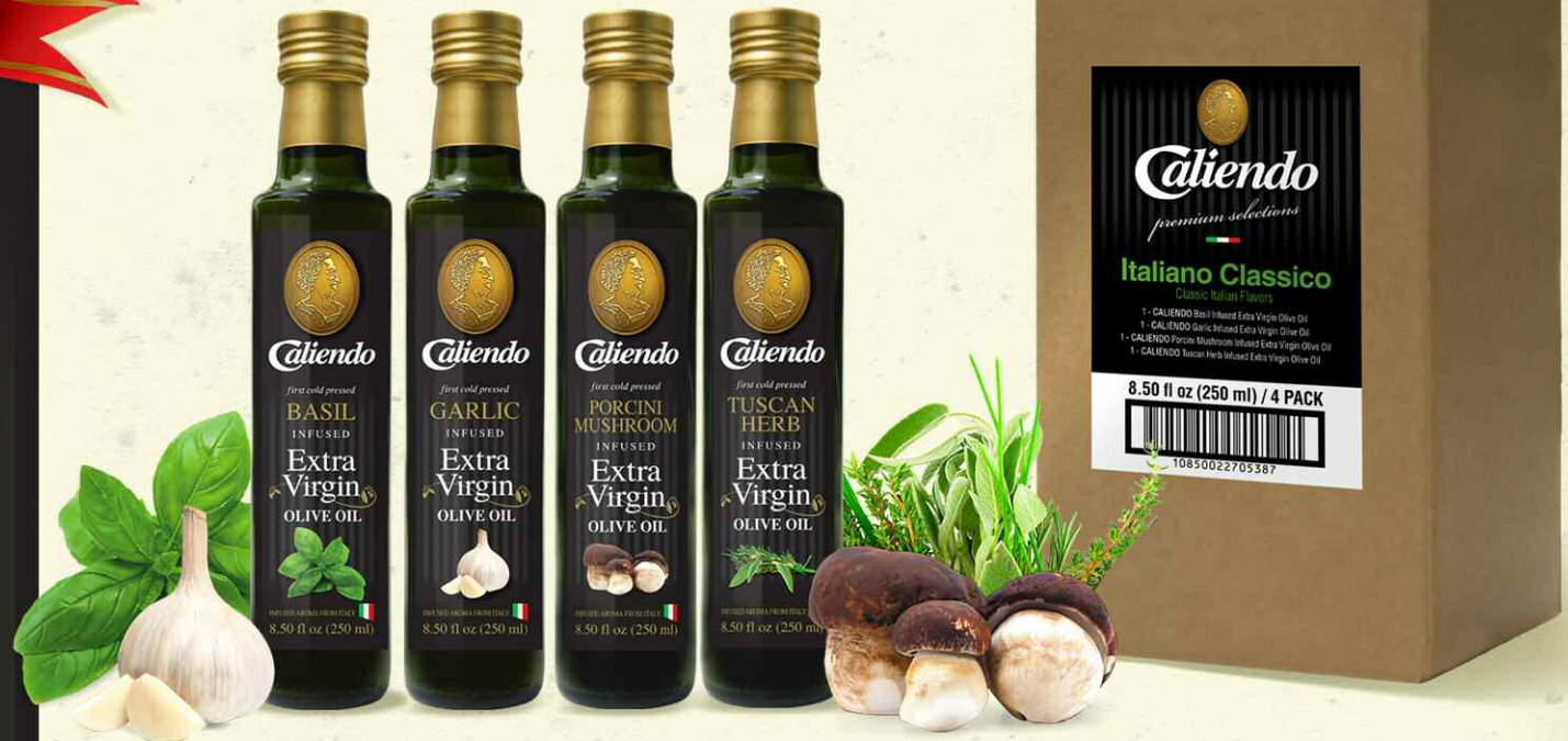
Italiano Classico shown